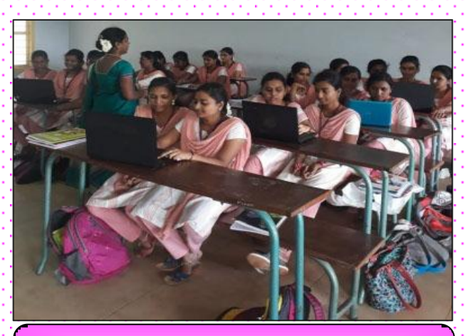
Our students are the users of various modern ICT Platforms.