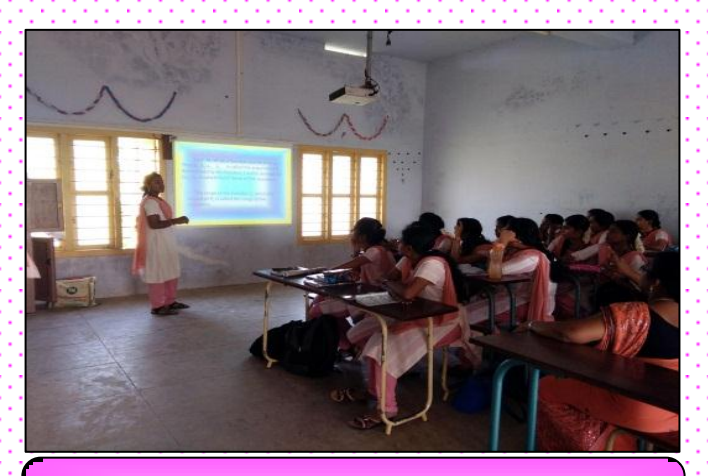
Students taking seminars using ICT facilities