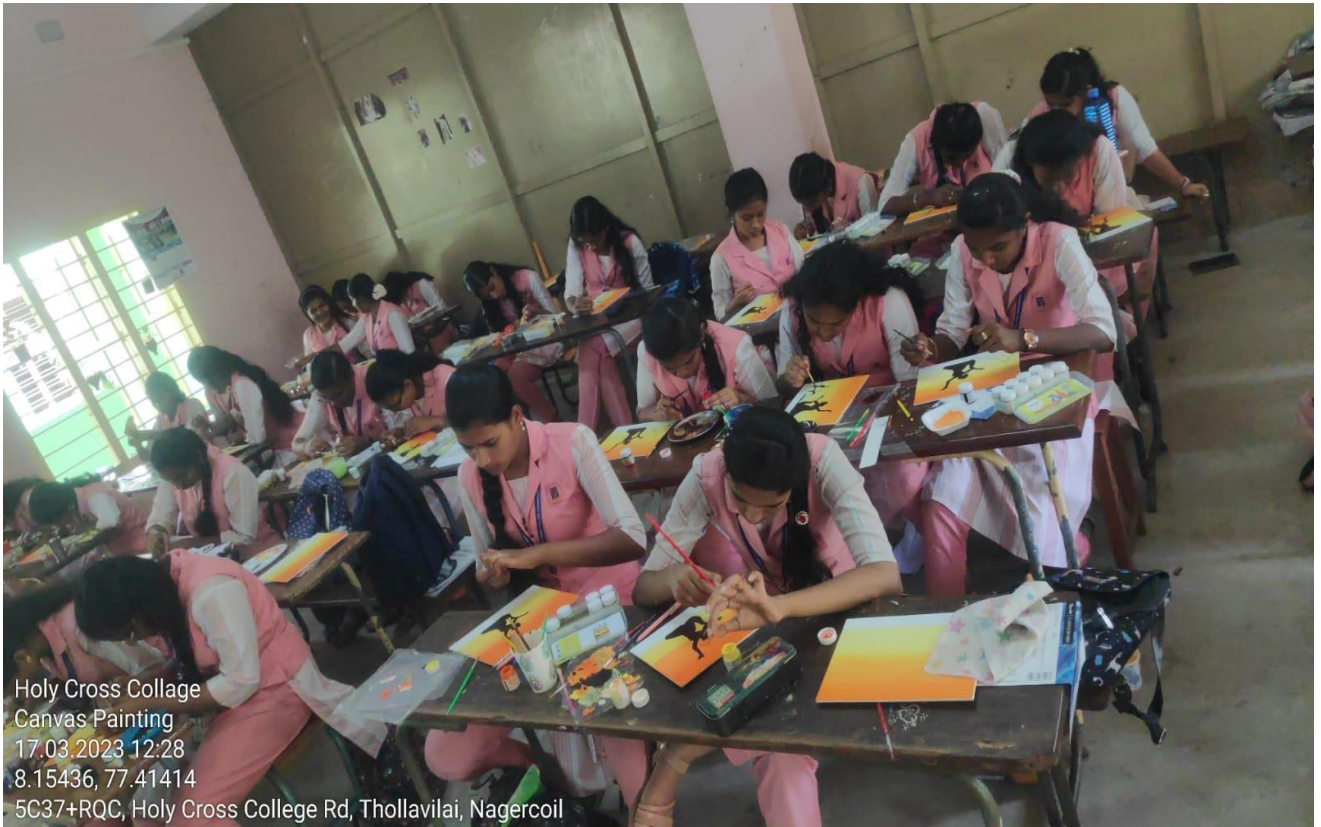
Holy Cross Collage Canvas Painting 17.03.2023 12:28 8.15436, 77.41414 5C37+RQC, Holy Cross College Rd, Thollavilai, Nagercoil