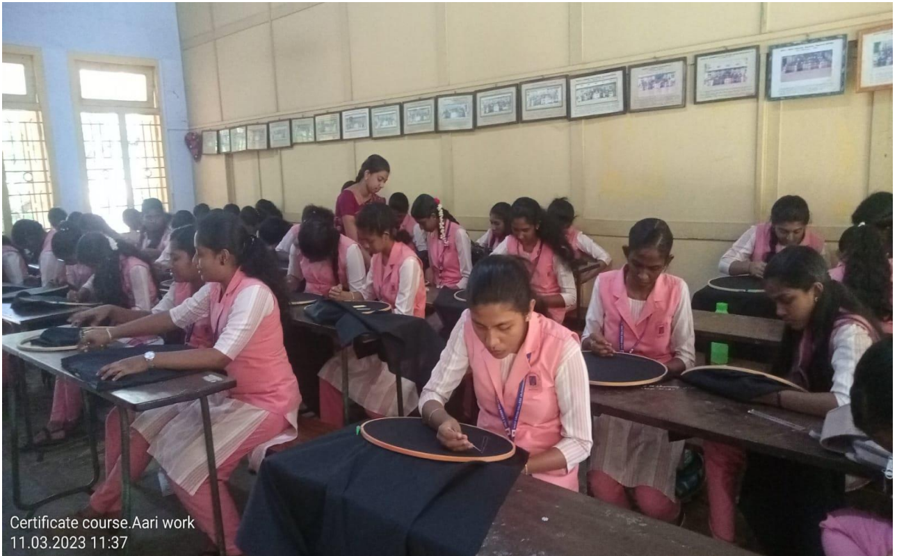
Certificate course.Aari work 11.03.2023 11:37