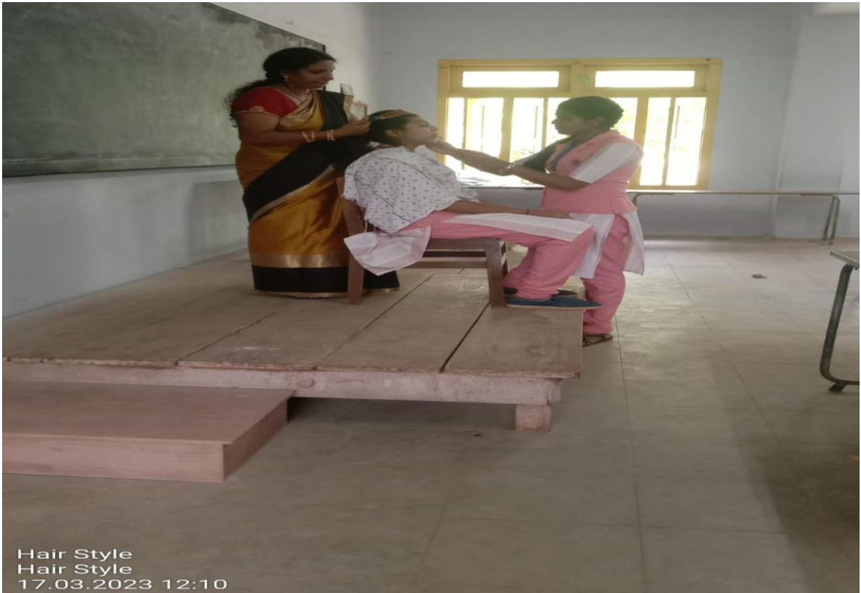
Hair Style Hair Style 17.03.2023 12:10