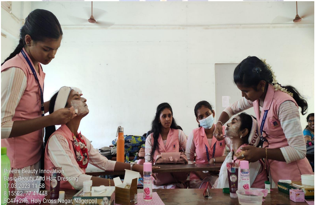
Preethi Beauty Innovation Basic Beauty And Hair Dressing 17.03.2023 11:58 8.15522, 77.41448 5C47+2R6, Holy Cross Nagar, Nagercoil