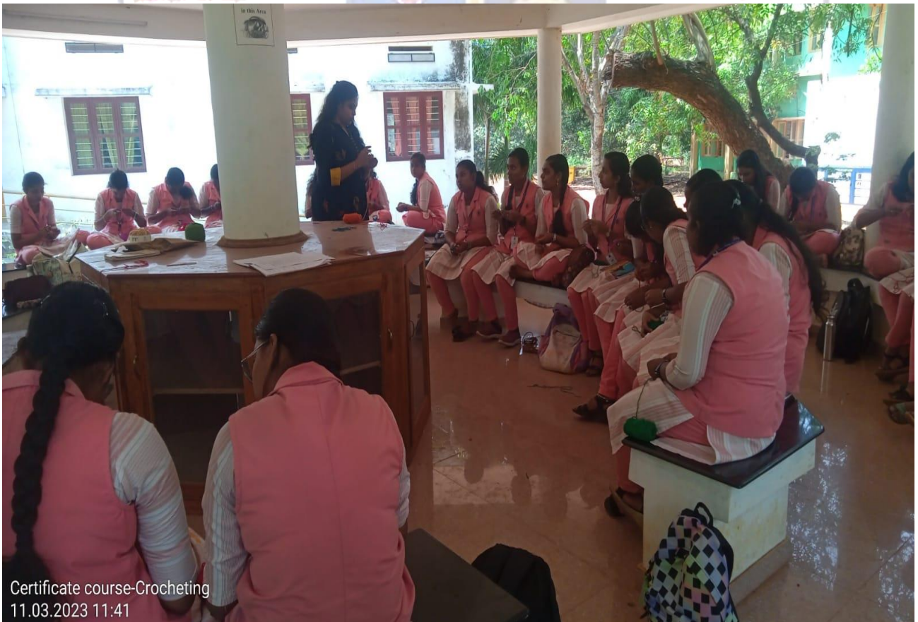
Certificate course-Crocheting 11.03.2023 11:41