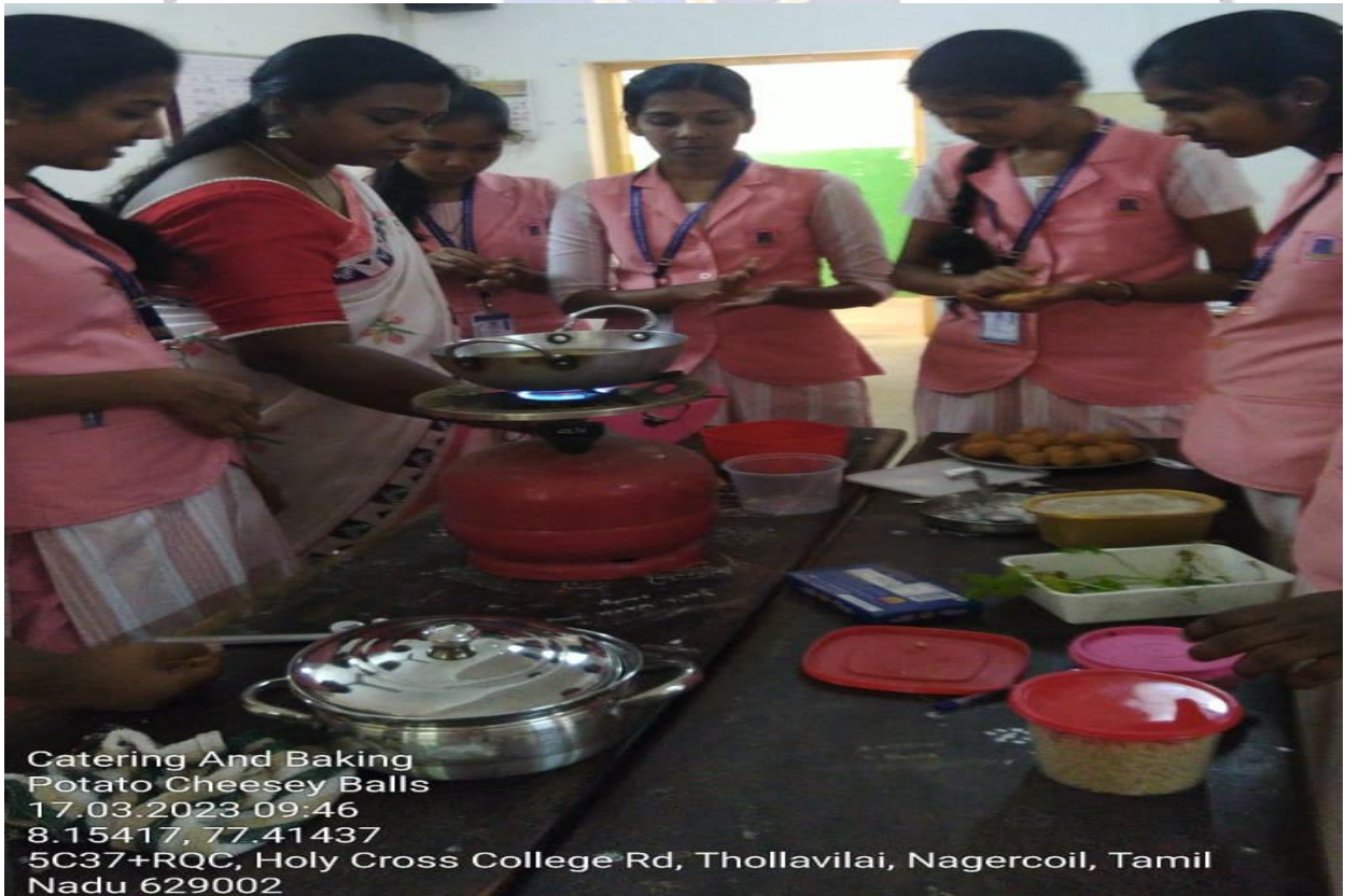
Catering And Baking Potato Cheesey Balls 17.03.2023 09:46 8.15417, 77.41437 5C37+RQC, Holy Cross College Rd, Thollavilai, Nagercoil, Tamil Nadu 629002