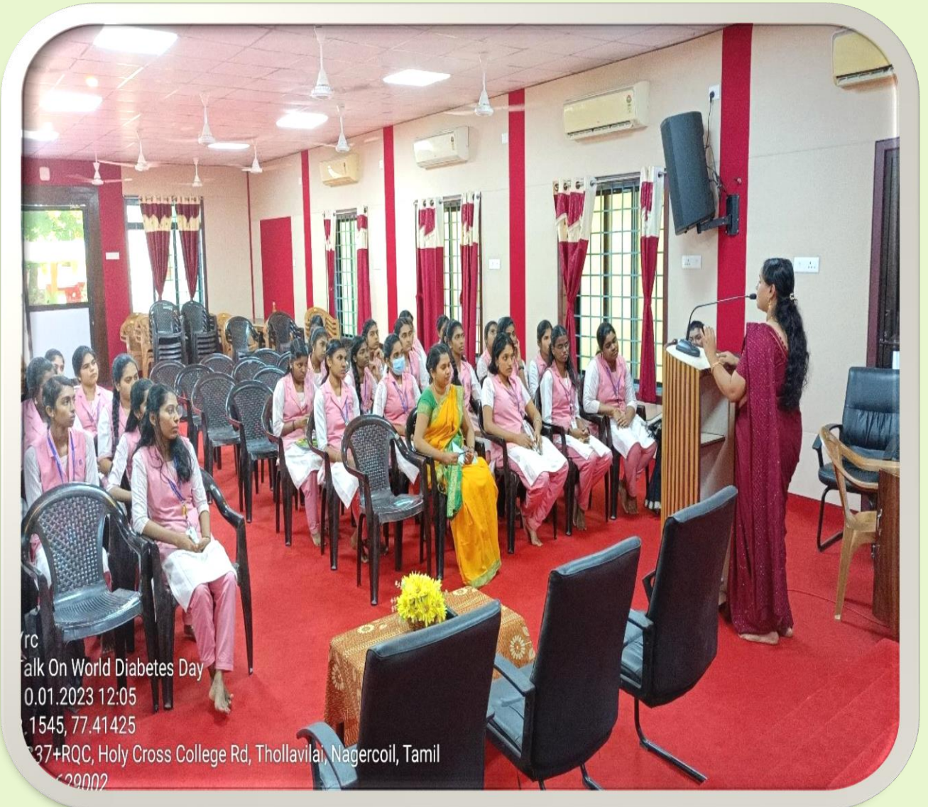
rc Talk On World Diabetes Day 0.01.2023 12:05 1545, 77.41425 37+RQC, Holy Cross College Rd, Thollavilai, Nagercoil, Tamil 629002